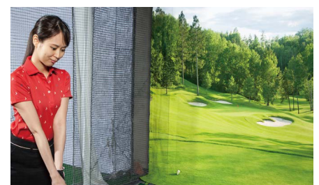
For entertainment use