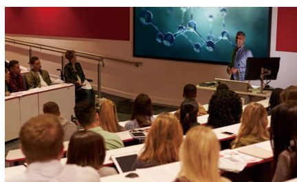
For academic use