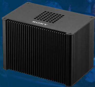
REA-C1000 Edge Analytics Appliance